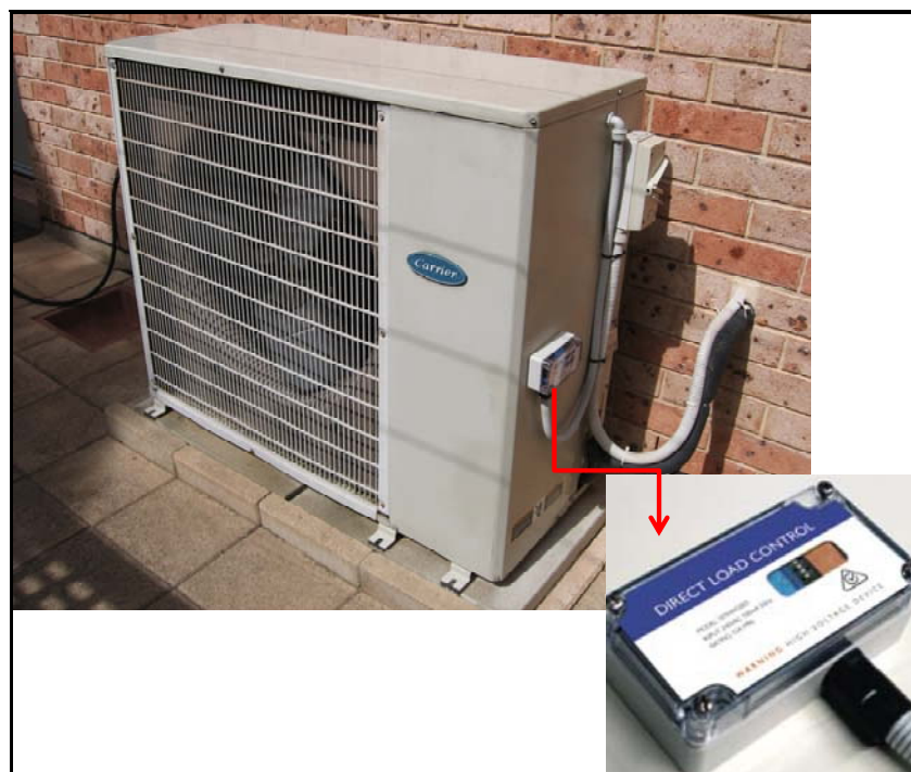
Figure 2. The Peak Breaker Direct Load Control Switch